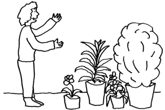
TALKING TO THE PLANTS ABOUT CHRISTIANITY