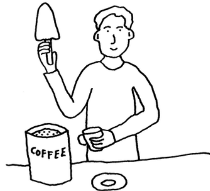
DISPENSING COFFEE WITH A TROWEL